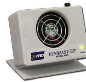
Mini-Fan Ionizer Model 4068