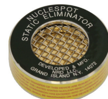
Stainless Steel Mini Spot Ionizer Model P-2042-2000