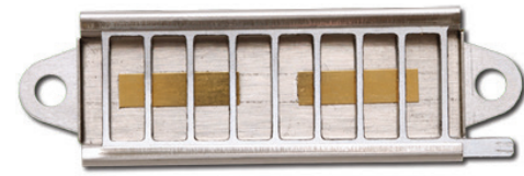
Ionizing Cartridge, 3" (500 \mu Ci) Model 2U500