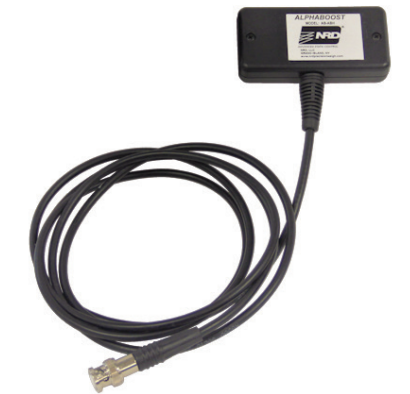
Alphabooost Static Control System Model AB-TC-1