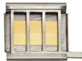
Ionizing Cartridge 1" (500 \mu Ci) Model 1U400

Model BF3 Model BF2-1000 Model BF1-500 Model 5060