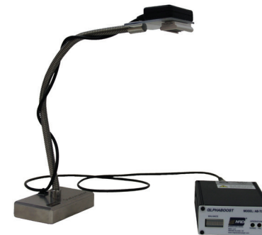
Alphie Model AB-TC-1B