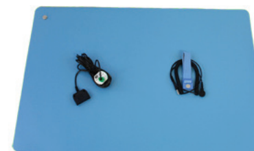
ESD Workstation Kit Model 5021